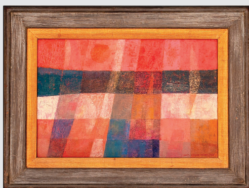
George Morrison Abstract Landscape Goes 10 Times Above High Estimate At Showplace

NEW YORK CITY — At Showplace's fall fine art and design auction on October 22, a 1957 oil on canvas by Native American artist George Morrison (American, 1919-2000) titled "Heal" or "Defractional" depicting an abstract landscape beneath a vibrant red sun sold for $81,250. The piece had both a Grand Central Art Galleries stamp and label and an Art Lending Services of the Museum of Modern Art label to verso. The piece far exceeded the $6/8,000 estimate. For information, 212-633-6063 or www.nyshowplace.com .