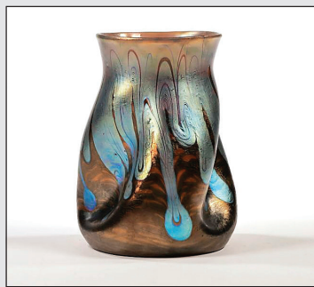
Loetz Art Glass Vase Brings

10 Times High Estimate At ACES Auction STAMFORD, CONN. — Cultivated from more than 20 local estates and collectors, ACES Gallery's fall fine and decorative arts auction on October 15 had a little something for everyone. From a Briarcliff, N.Y., family, residents for more than 100 years, was a Loetz Austria art glass vase that ignored a $400/600 estimate to finish at $6,000. With polished pontil, it was signed "Loetz Austria" with a 6½-inch height and 6¾-inch diameter. For information, www.aces.net or 914-222-8686.