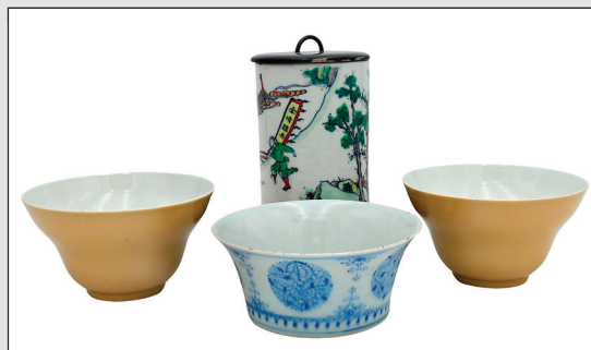
Four-Piece Chinese Group Surprises At Nadeau's Auction

BEVERLY, MASS. — Kaminski's auction on Saturday, October 21, featured collections of gold coins. A Newburyport, Mass., collection of gold coins included a 1904-S $20 gold double eagle, a 1911 $10 Indian Head gold coin and an 1888 seated Liberty half-dollar coin, among others. From a South Hamilton, Mass., collection came the star lot, an 1806 round 6 $5 gold half eagle coin, which finished at $12,000. The round 6 designation refers to one of two major varieties of the 1806 $5 gold turban head half eagle. One variety is the "Pointed 6" variety, which features a pointed tip on top of the number "6" in the 1806 date. The other major variety, which this one was, has a rounded top or knob on the "6." For information, www.kaminskiauctions.com or 978-927-2223.