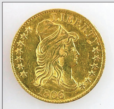
1806 $5 Gold Half Eagle Rounds To $12,000 at Kaminski Sale

BEVERLY, MASS. — Kaminski's auction on Saturday, October 21, featured collections of gold coins. A Newburyport, Mass., collection of gold coins included a 1904-S $20 gold double eagle, a 1911 $10 Indian Head gold coin and an 1888 seated Liberty half-dollar coin, among others. From a South Hamilton, Mass., collection came the star lot, an 1806 round 6 $5 gold half eagle coin, which finished at $12,000. The round 6 designation refers to one of two major varieties of the 1806 $5 gold turban head half eagle. One variety is the "Pointed 6" variety, which features a pointed tip on top of the number "6" in the 1806 date. The other major variety, which this one was, has a rounded top or knob on the "6." For information, www.kaminskiauctions.com or 978-927-2223.