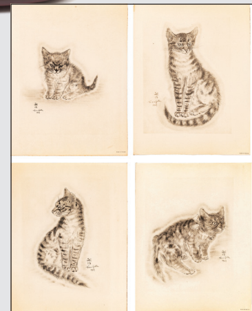
Foujia's 'Cats' Make Superb Impression At DuMouchelles

DETROIT, MICH. — The "Cat Master," Léonard Tsuguharu Foujita (French/Japanese, 1886-1968), was a painter and printmaker born in Tokyo, Japan. His Western-style paintings were rendered with Japanese ink techniques. His love of cats comes through with the collotypes on handmade Arches paper, 1930, comprising his Book of Cats , which sold for $27,900 in DuMouchelles' October 20 auction. The superb impressions of an extremely scarce set were won by a Japanese bidder. There were 18 of 20 works, each work is signed and dated in the plate, from the edition of 500, each with "Made in France" ink stamp in lower right margin. For information, 313-963-6255 or www.dumouchelles.com .