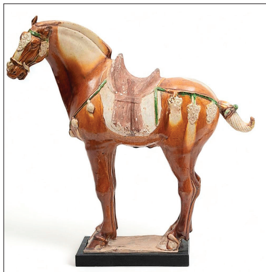
Dated to the Eighth Century and accompanied by a rosewood display cabinet (not pictured), this Chinese Tang dynasty-style polychrome earthenware Sancai Ferghana horse had been purchased in Tokyo by a Michigan collector whose estate DuMouchelle’s is selling. It sold to a local buyer for $4,193 ($1/3,000).