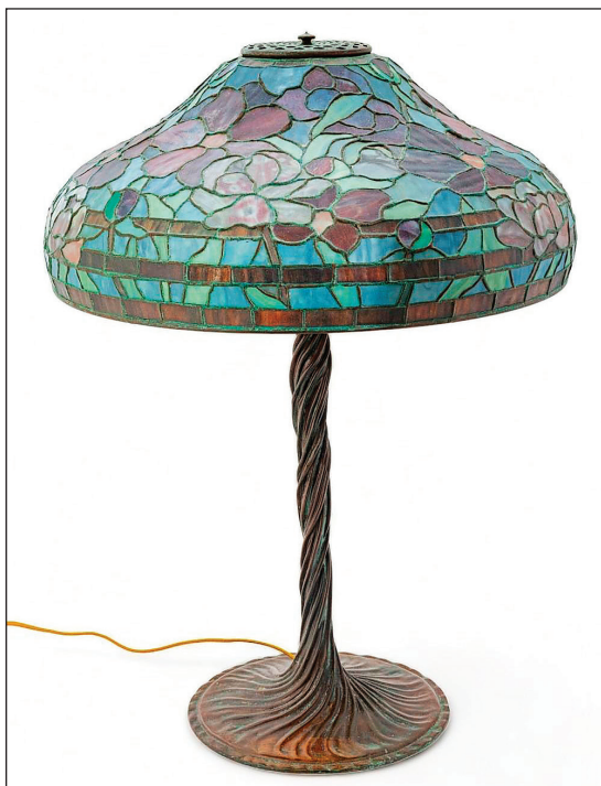
This fine reproduction Tiffany Peony lamp came from the Paskowski estate and sold to a buyer in New England for $4,960 ($400/600).

DETROIT, MICH. — Bidders competed for 1,020 lots in DuMouchelles’ December 2023 auction on December 14 and 15. More than 80 percent of the lots gavelled down successfully from the podium, with after-sale transactions likely taking place as they usually do.