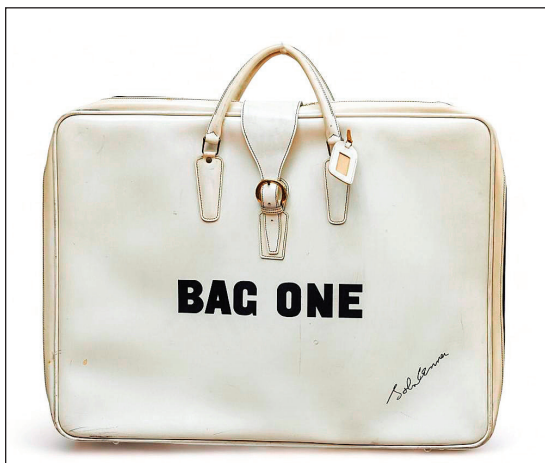
This white vinyl portfolio case houses three lithographs on paper done by John Lennon in 1970. “Bag One,” which was published by Cinnamon Press in New York, found a new home with a local buyer for $6,200 ($4/6,000).